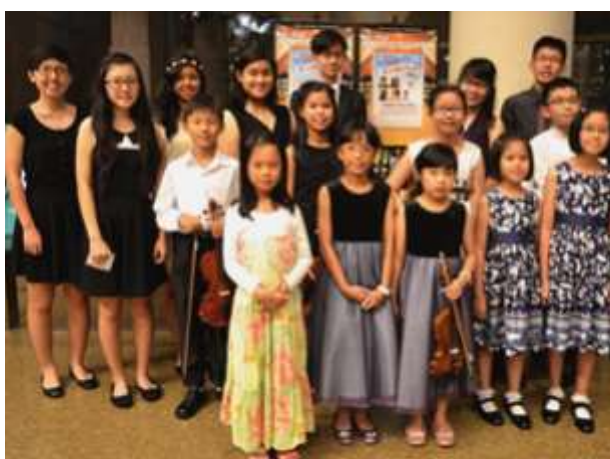
Student performance at the Esplanade Concourse in "School's Out", organized by the Esplanade.