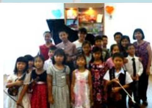
Performance Lab for students