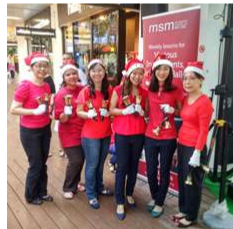
MSM Handbell Ringers at a caroling presentation at HillV2