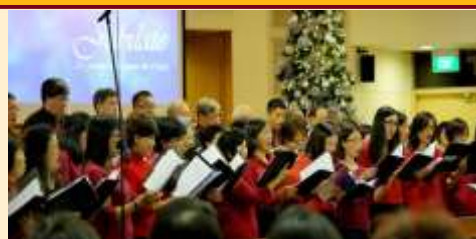
The MFC singing at Barker Road Methodist Church

If you are interested in participating in this ministry as a supporter or a chorister, please write in to: <festivalchoir.msm@gmail.com>