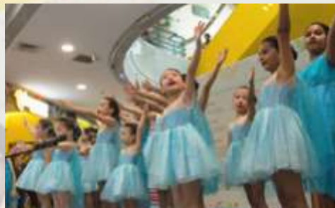
Enthusiastic ballerinas at The Forum Shopping Mall

It was a year of performance opportunities for the various departments at MSM. Apart from the regular offerings of music masterclasses and the biennial music competition held on November 25 th for piano and November 27 th for strings and a performance lab (November 26 th ), selected students also performed at the Forum Shopping Mall on November 1 st . The programme there consisted mainly of piano, dance, singing and guitar items. Another significant performance opportunity was the invitation to perform at the Esplanade Concourse on November 11 th . The year ended with the Annual Student Recital on December 6 th at the Methodist Girls' School (Blackmore Drive) Auditorium. The programme incorporated performances by the high scorers from the Competition, carol singing and organ music, ensemble and Christmas items, and a presentation by the Ballet Department.