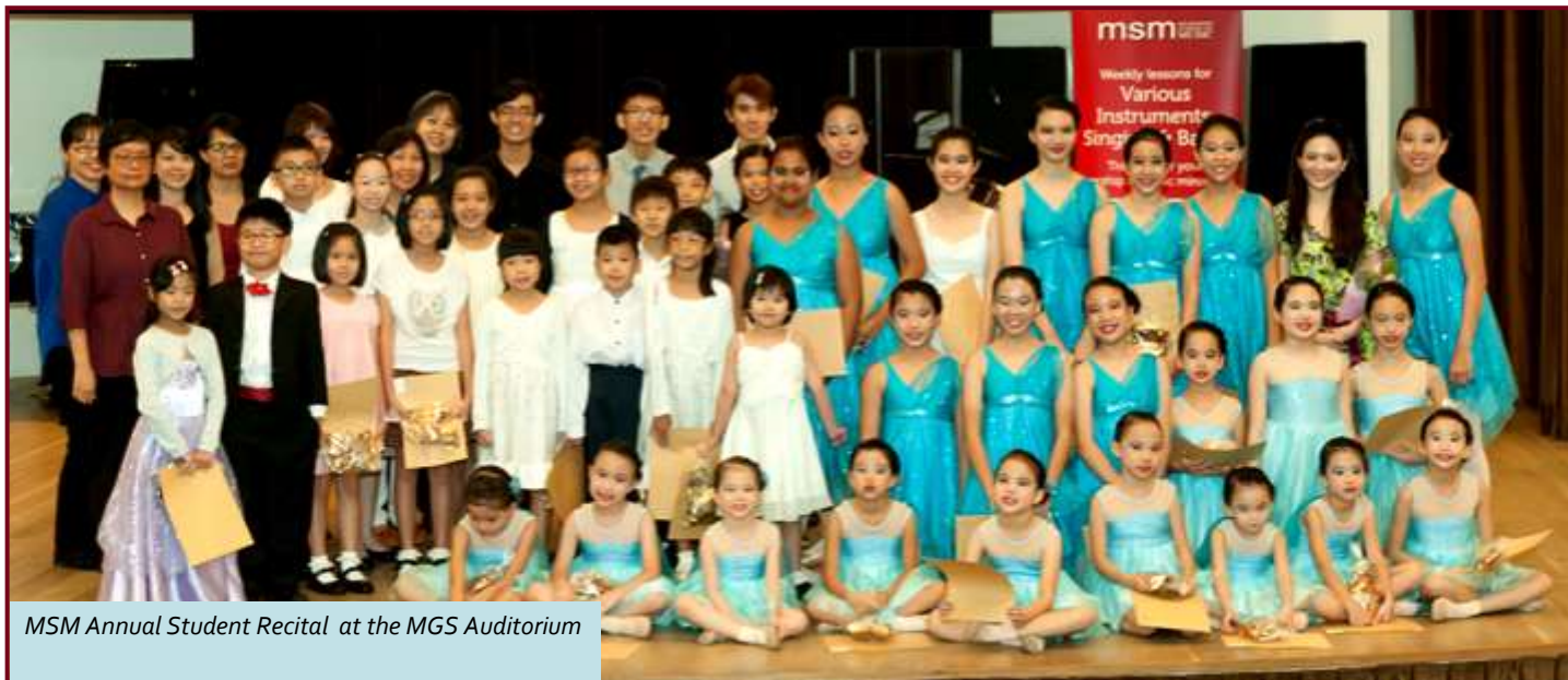
MSM Annual Student Recital at the MGS Auditorium