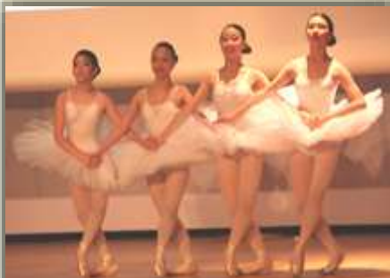
Nimble feet and graceful dances