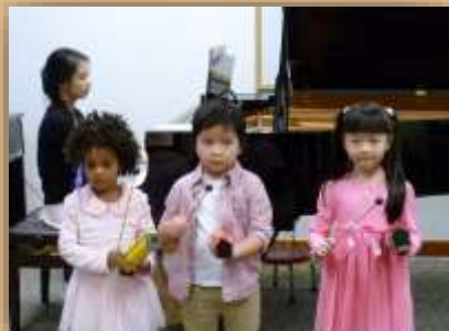
Debut mini-concert by the young graduands

The school launched a new children's music programme based on the "Little Mozarts" method from the USA. Here, children of ages 5-6 are introduced to elements of music. Through games, toys and performances and fun-filled interaction, the children acquire new skills and present a mini-concert to mark each level.