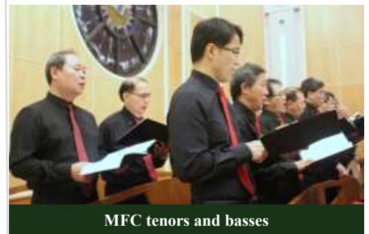
MFC tenors and basses

many who were enthused by the whole project! All in all, 75 choristers were selected. Each person committed themselves to the debut season, which culminated in an Advent