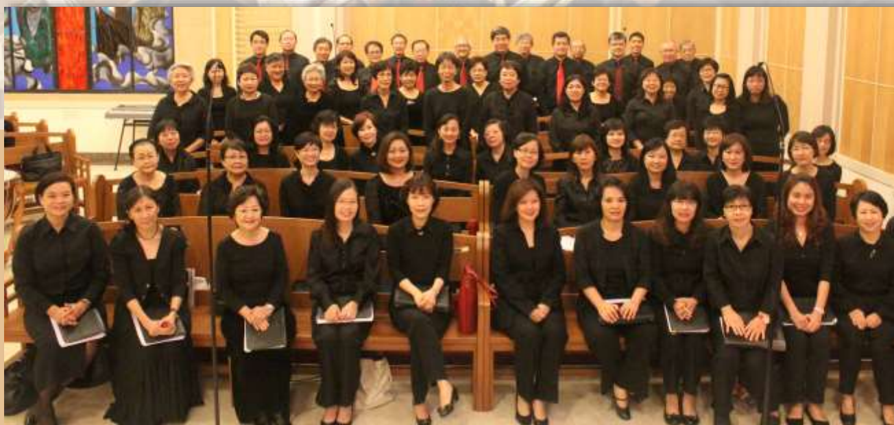
The founding members of the Methodist Festival Choir (December 2013)