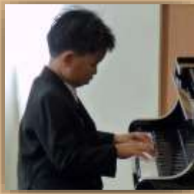
Left; Budding pianist in action

The Performance Labs are opportunities for MSM students to play for their friends, families and peers. In 2013, these mini-concerts were held on 15th June and 28th November.