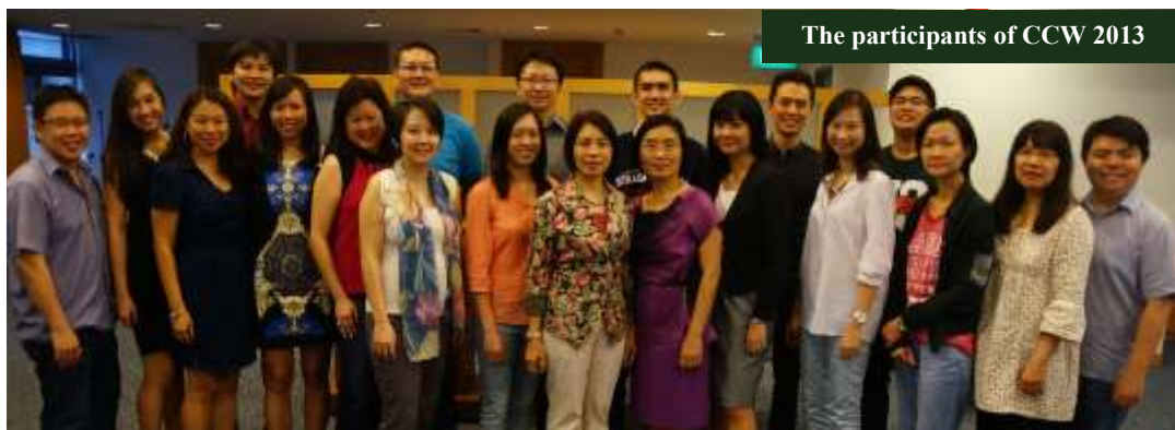
The participants of CCW 2013

CCW 2014 will continue in English, and a new version will be run in Chinese. The modules will run at classrooms at Trinity Theological College and Methodist School of Music.