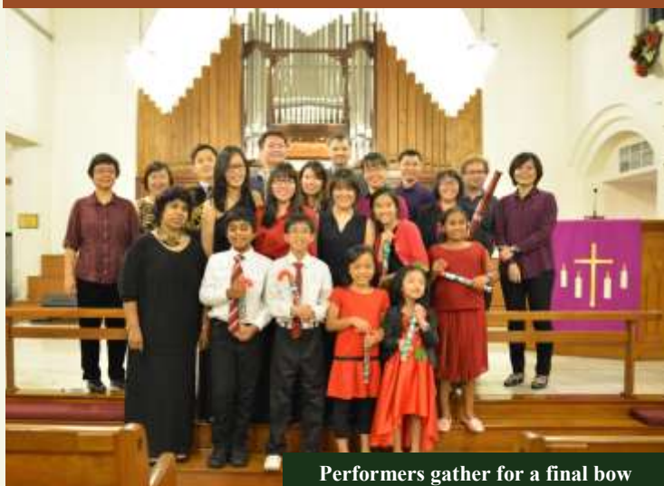
Performers gather for a final bow