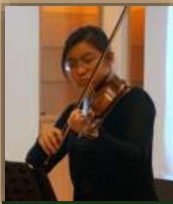
Expressive violin solo